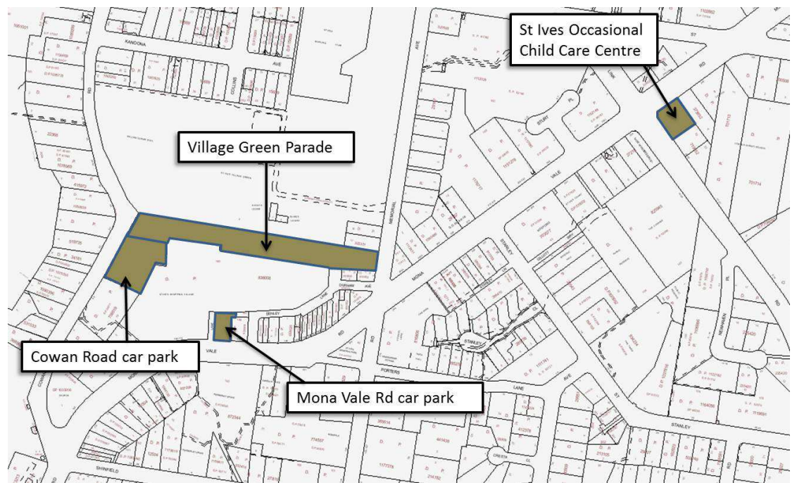
Figure 6 – Council-owned land classified community